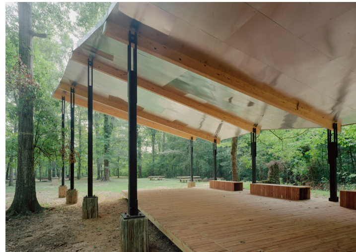
PARK PAVILION :: PERRY LAKES PAVILION