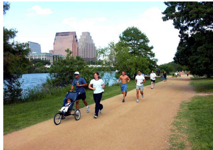
HIKE AND BIKE TRAIL :: AUSTIN TX