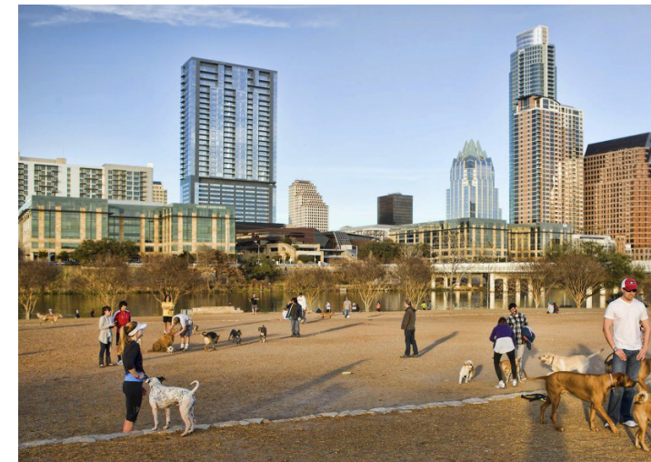
TOWN LAKE OFF LEASH PARK :: AUSTIN TX